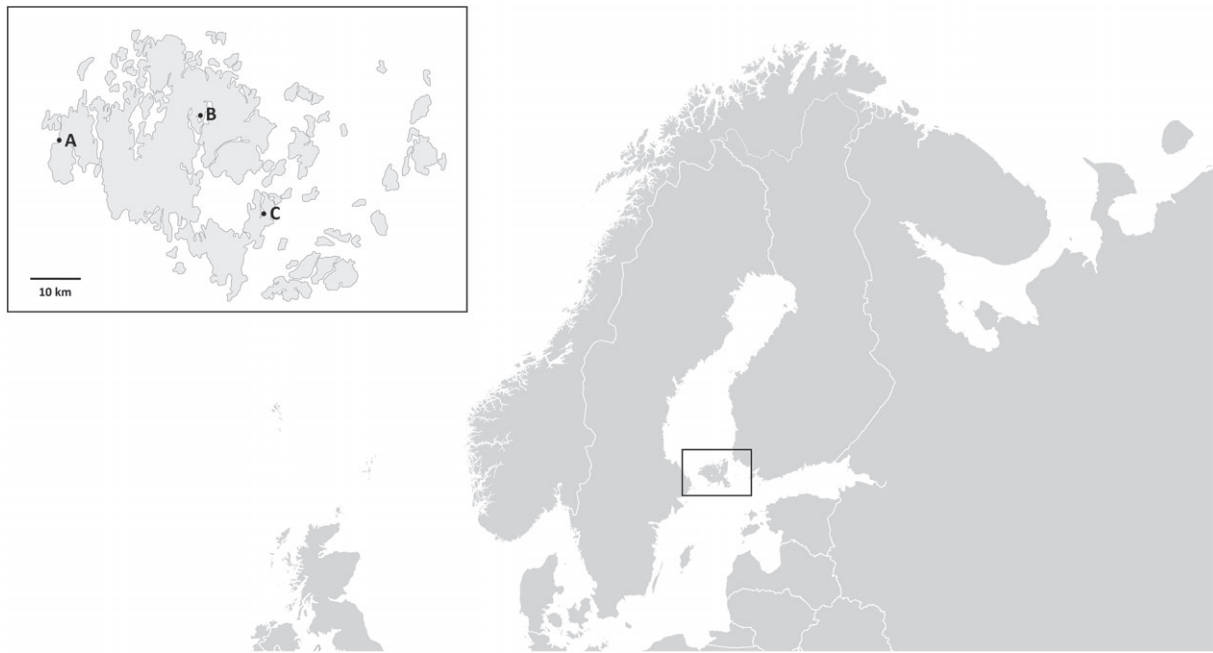
Fig. 1. The location of the Åland Islands, where the inset shows the three Plantago lanceolata populations from which seeds (A, B, C) and soil used for inocula (A) were collected.

instar, when they disperse to pupate (Kuussaari et al. , 2004; Saastamoinen et al. , 2013).